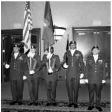
Ac tive duty 196th Color Guard