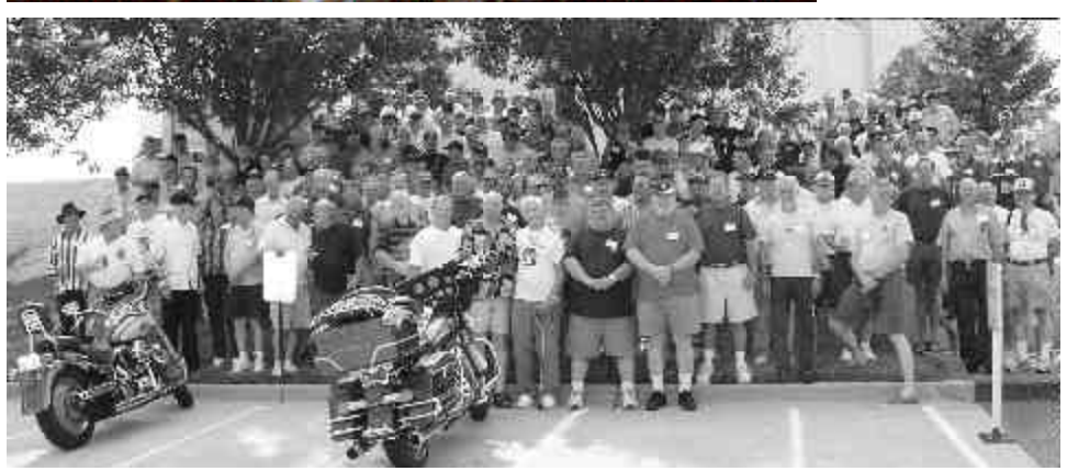
Group photo out side the ho tel. Many of the at ten dees were out en joy ing the Branson at trac tions and missed the im promptu group photo