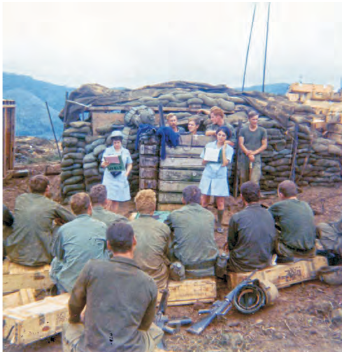
Red Cross ladies on LZ Center

When Delta Company would come on to the LZ, we would move into these bunkers and stay three days, and then move out and then another company would come on and replace us as we moved off the LZ. Nobody stayed in these bunkers permanently.