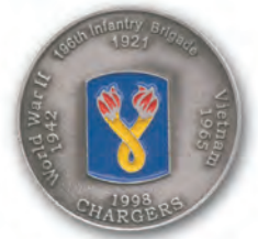
196th CHALLENGE COIN