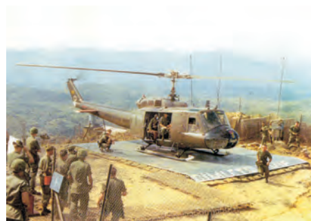
Americal Commanding General visits LZ Center

While on LZ Center we got a chance to sleep off the ground in a dry bunker, we had a mess hall to get a hot meal... and a chance to fill sandbag after sandbag all day long.