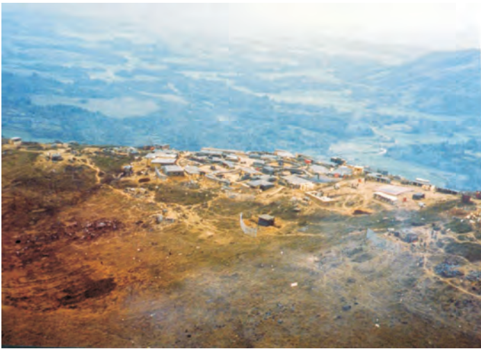
LZ Center from the air

A description of LZ Center would be a mountain top about 350 feet high with two sets of concertina wire circling the top, about 800 feet long and 300 feet wide. Inside the wire was Headquarters of the 3/21st Infantry.